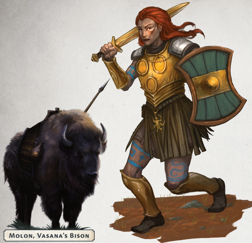
MOLON, VASANA'S BISON